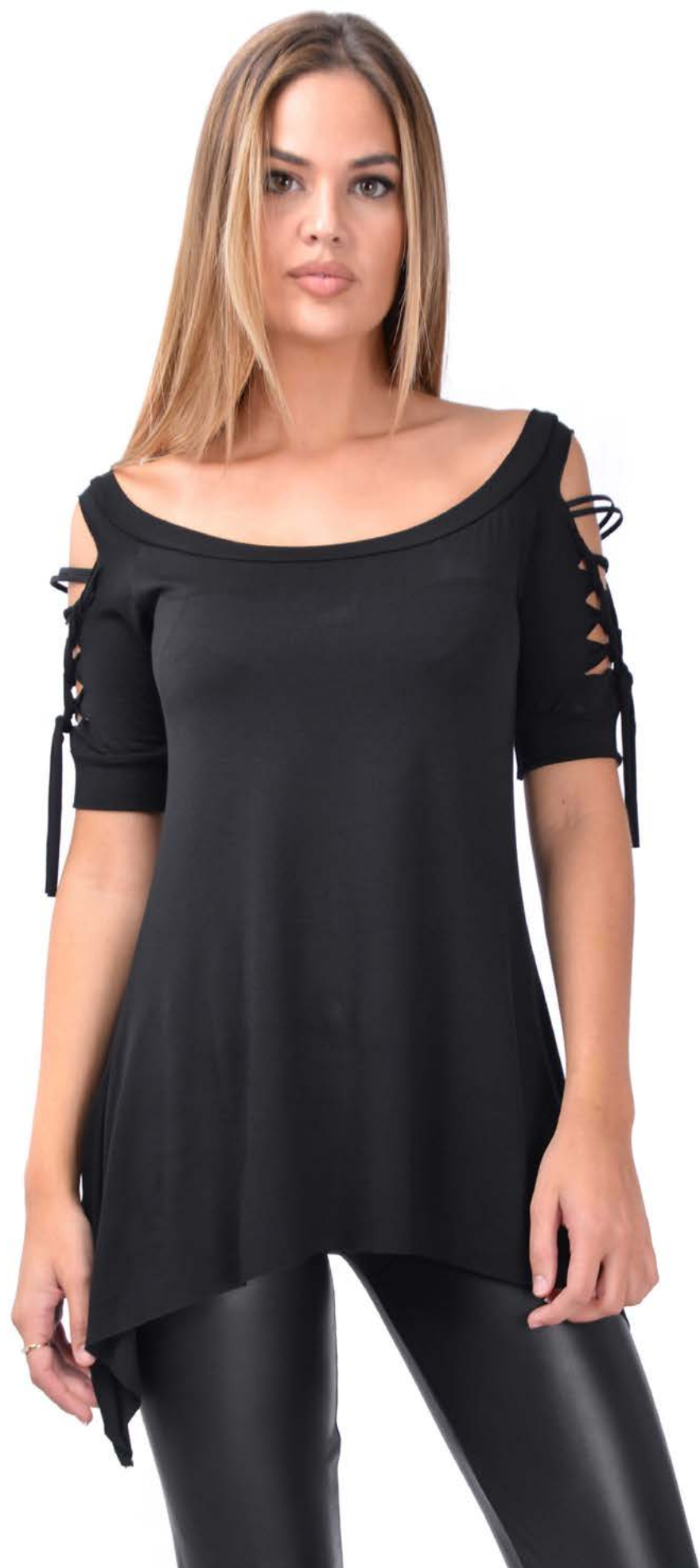
OV- Private Collections