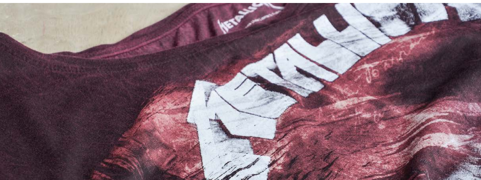
OV- Private Collections

We use our extensive knowledge and experience in the production of garments by offering varied collections, different from the rest of the market.