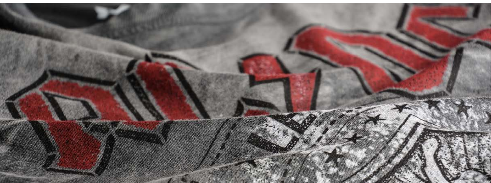
OV- Private Collections

Our team of professionals supervises closely throughout the production process, deliveries, storage and transportation of products. According, at all times, to interest and customer needs.